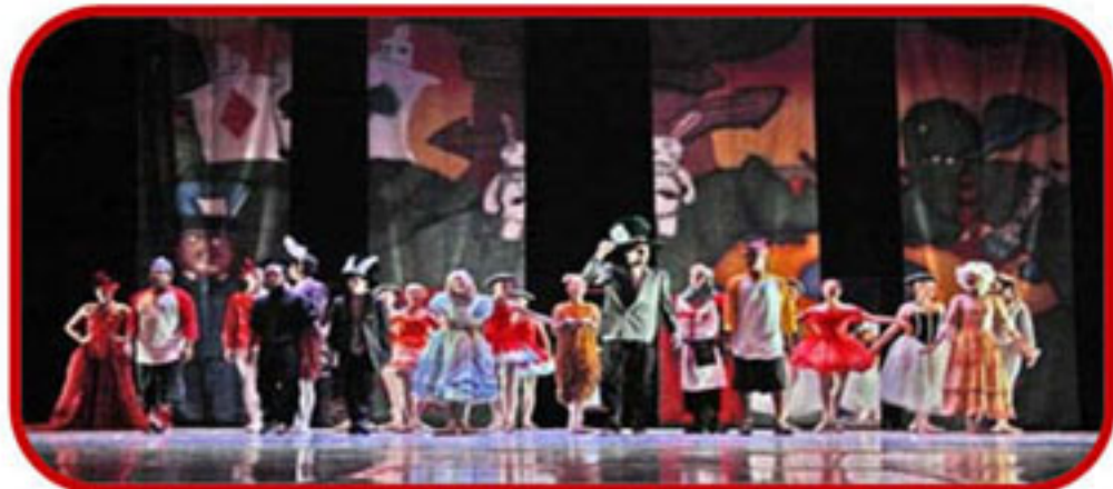
San Diego Ballet ... final 'bows'

Watch for the SD Ballet's own version of NUTCRACKER at the Birch North Park Theatre, on Sat-sun, Dec 3-4 th – co-produced with the Grossmont Symphony Orchestra & Master Chorale – with additional singers from the SD Children's Choir .