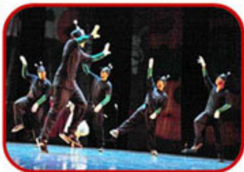
Culture Shock Alumni Dancers